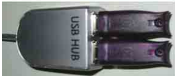
USB Game Dongle Not Activated

The New Multi-Game shell supports the ability to install and play multiple games on one cabinet; allowing the operator to customize and install games that suite their location. Each Game installed on the Vortek cabinet comes with a USB Game Dongle. If more than one game is installed a USB HUB is used to create enough USB ports for up to 4 USB Game Dongles. When the USB Dongle is installed and working properly a Red LED light will illuminate inside the Dongle. In order for a USB Game Dongle to be recognized correctly it must be inserted into the USB port before the cabinet is powered ON. If for some reason the USB Dongle is not recognized power the cabinet OFF then ON to see if this resolves the problem.