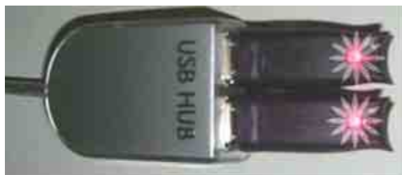
USB Game Dongle Activated