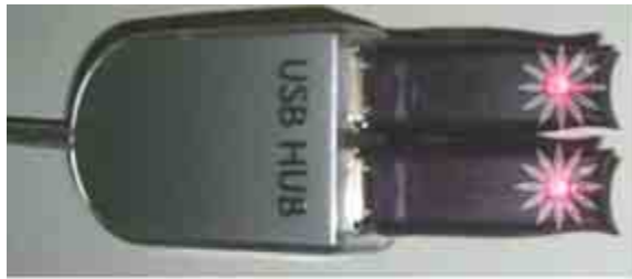
USB Game Dongle Activated