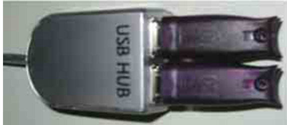
USB Game Dongle Not Activated

The New Multi-Game shell supports the ability to install and play multiple games on one cabinet; allowing the operator to customize and install games that suite their location. Each Game installed on the PUP cabinet comes with a USB Game Dongle. If more than one game is installed a USB HUB is used to create enough USB ports for up to 4 USB Game Dongles. When the USB Dongle is installed and working properly a Red LED light will illuminate inside the Dongle. In order for a USB Game Dongle to be recognized correctly it must be inserted into the USB port before the cabinet is powered ON. If for some reason the USB Dongle is not recognized power the cabinet OFF then ON to see if this resolves the problem.